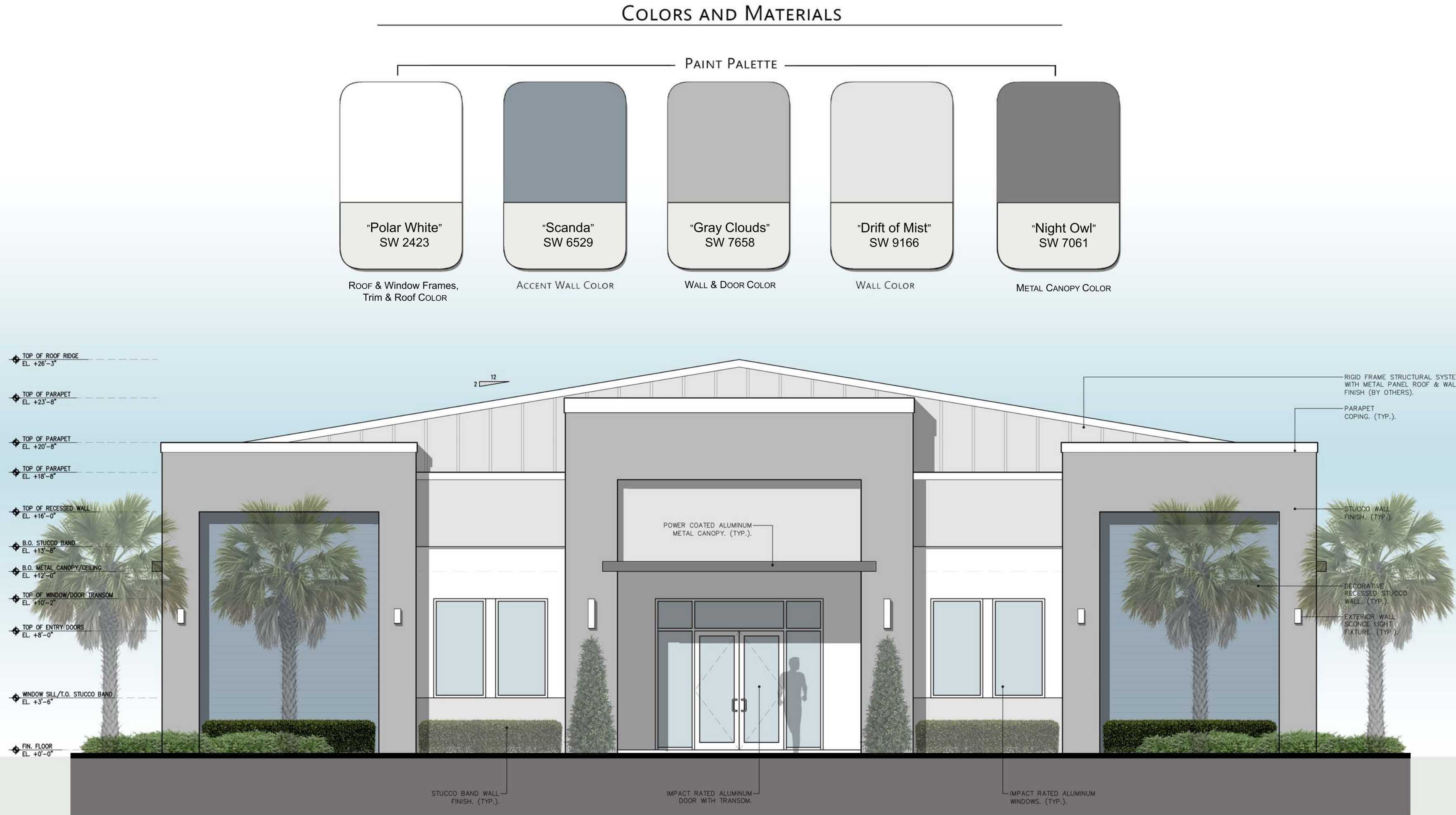
1 Proposed North Elevation :: Front SCALE: 3/16"=1'-0"